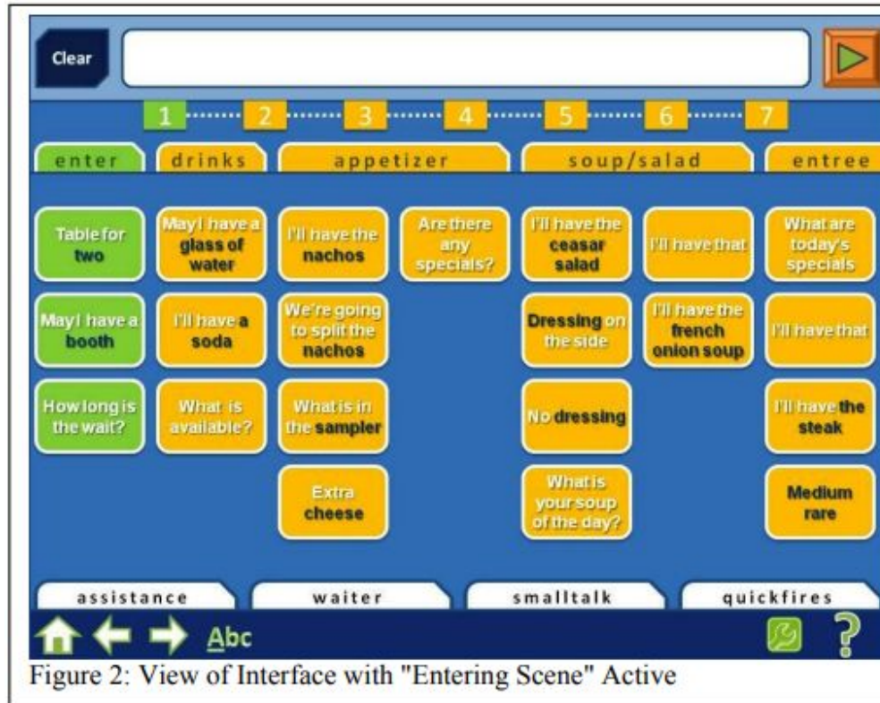
Utterance-based AAC design for eating at a restaurant (McCoy et al., 2010)