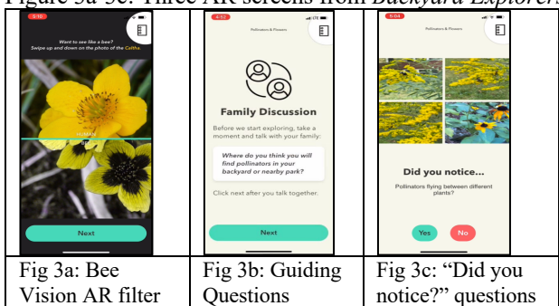
Figure 3a-3c: Three AR screens from Backyard Explorers MAR app designed for at-home use.