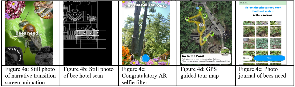
Figure 4a-4e. Five AR screens from Pollinator Explorers MAR app designed for a nature center.

MAR filters and animations included (1) an animation of what bees need in their habitats that narratively tied the stops together (figure 4a); (2) microscopic scan of a pollen grain and x-ray scan of a log (environmental center location) or bee hotel (arboretum) containing native bee's nest (figure 4b); (3) an AR filter showing content elements like bees, butterflies, and flowers through the front-facing camera for a family selfie (figure 4c). Digital resources tied to place were triggered by GPS (figure 4d) and tracked the families' location on a map and showed their next stop on their journey to learn about pollinator habitats as they walked the environmental center. Science content was launched when families reached the GPS position specified for that stop, with families then tapping a "next" button to navigate through the location-specific content. Photo capture and questions prompts guided families' observations and discussions of pollinators and their habitats. Families were given discussion questions and observation checklists to prompt their observations of pollinator behavior and what pollinators need in their habitat throughout the tour. The app deployed a rear-facing camera for families to collect evidence of what they had learned at each stop which then automatically populated a travel journal that the families could view at any time. This functioned as a photo journaling activity where families chose the pictures that best represented a bee's needs (figure 4e).