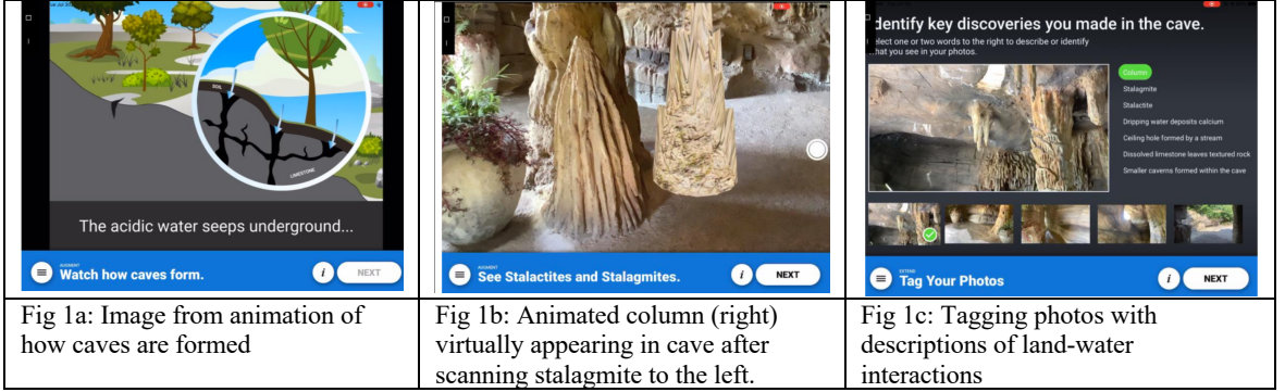
Figure 1a-1c: Screen captures from the Cave Explorers mobile AR app for use in an arboretum.

MAR filters and animations included (1) 2D animations viewed within the app that illustrated how caves are formed from interaction of limestone rock and water over time (figure 1a); (2) Animation of how stalactites and stalagmites join over geologic time to form a column; the AR animation is virtually displayed within the cave when viewed by holding up the iPad screen; (figure1b); (3) AR filters displayed stalactites and stalagmites through the front-facing camera for a "family cave selfie". Digital resources tied to place were triggered by user selection or by scanning an object within the exhibit space. Science content was launched in 2 ways: (1) families tapped a "next" button to launch content or were prompted where to look or what to discuss; or (2) families scanned 3D objects in the cave using the iPad (e.g., a stalagmite on the ground of the cave) to trigger an animation. Photo capture and question prompts guided families' observations within the cave. The app deployed a rear-facing camera for families' to take photographic evidence of water-limestone rock interactions. They could then annotate their photos using "tags" that prompted them to articulate evidence they found (figure 1c). This served as a photo journaling activity that connected app content and families' observations.