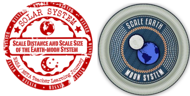
Figure 2. A TLJ stamp (left) and a TLJ badge (right).

Solar System is a good example. This Scale Models activity has three options for teachers: (1) the entry-level activity is earning a TLJ stamp (Figure 2 left); teachers attend the webinar and write one brief reflective post, (2) a higher level of mastery means earning a TLJ badge (Figure 2 right), teachers also attend the webinar but they write a full lesson plan on incorporating the content into classroom activity, or (3), teachers can earn both the TLJ stamp and badge for this Scale Models activity by meeting both the stamp and badge criteria. To make the stamp and badges visually distinct, the stamp was given a design akin to a passport office rubber stamp and the badge an embroidered patch as shown in Figure 2.