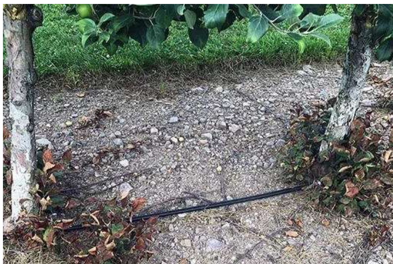
Drip irrigation in orchard.

Irrigation helps grow agricultural crops, maintain landscapes, and revegetate disturbed soils in dry areas and during periods of inadequate rainfall. Precipitation in Pennsylvania averages about 37 inches each year. About 13 inches of this precipitation runs off the land into streams, while 24 inches infiltrates into the soil, where it can be used by crops. While uneven precipitation can cause plant stress during critical growth periods, which will affect both crop productivity and produce quality, most horticultural crops require supplemental irrigation to minimize plant stress. Proper timing of water applications during appropriate periods can increase the yield and quality of most horticultural crops in Pennsylvania in most years. Critical periods for the irrigation of apples are during flower formation, early fruit set, and during final fruit swell (Penn State Extension, 2017: Irrigation for fruit and vegetable production ( https://extension.psu.edu/irrigation-for-fruit-and-vegetable-production )).