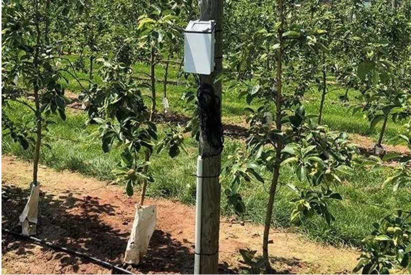
Irrigation set-up.

Working with growers to effectively implement a precision irrigation system is the major focus of these projects. In 2019, the focus is on monitoring soil moisture levels using pre-existing irrigation plans. At the end of the 2019 season, a comprehensive evaluation will be conducted to assess how soil water levels fluctuated over the season and the effectiveness of the existing irrigation plan, to provide further information for developing sensor-based irrigation systems in 2020 and beyond.