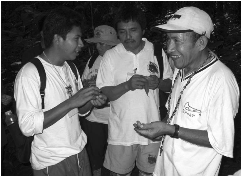
Fig. 3.2. Indigenous leaders on botanical walk in Posada Amazonas.