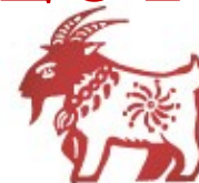
Yin Wood Goat