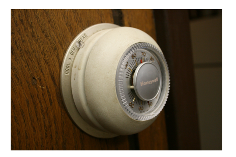
Figure: "Thermostat" by midnightcomm, CC BY 2.0