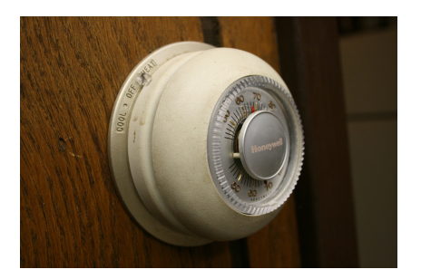
Figure: "Thermostat" by midnightcomm, CC BY 2.0