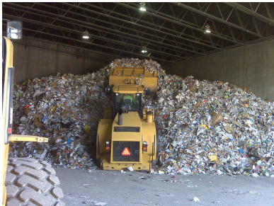
Figure: "ACE Solid Waste," CC BY 2.0