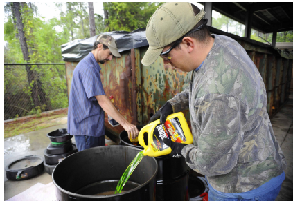
Figure: USAF, Public Domain