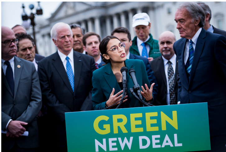
Figure: Friedman 2019