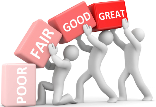
Figure: "Performance Evaluation Process" by Rizkyharis, CC BY-SA 4.0