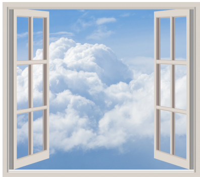
Figure: Public Domain