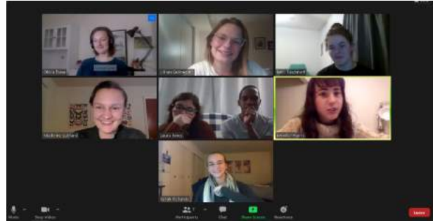
An ecology grad student organization game night

Ecology is a discipline of connectivity, a study of interactions. When connectivity and interactions are interrupted, the results can be disturbance and disruption. I began my graduate education, with many others, during the pandemic, and there certainly has been a sense of irony of studying the interconnectedness of insects and plants in a time when we are so disconnected from each other.