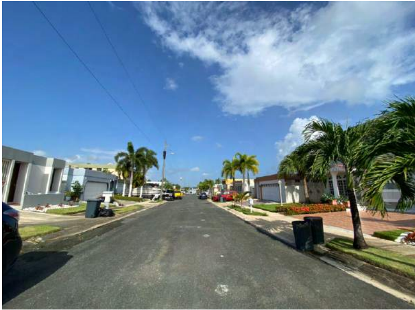
An urban field site in Bayamón, Puerto Rico.

Fiji Fan Palm is an example of an introduced, yet common palm in residential areas, and is potentially an important fruiting resource for urban birds.