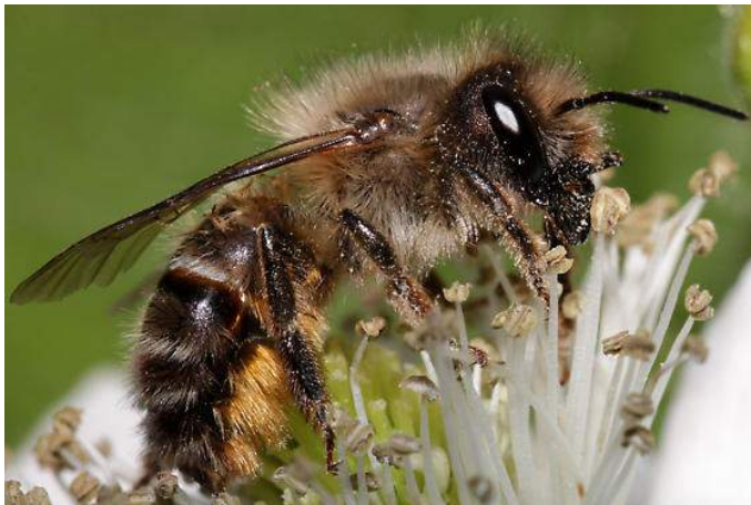
Osmia cornifrons , bugguide.net