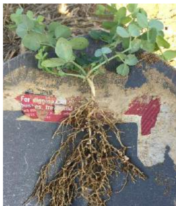
Pea plant with nodules

Legumes are able to fix Nitrogen because of their nodules. Legumes themselves can't fix nitrogen. Instead, they form a symbiotic relationship with rhizobia, or nitrogen fixing bacteria. Plants form nodules to serve as a haven for these nitrogen fixing bacteria. Nodules are where the N-fixing magic happens in legumes. The plant also rewards the rhizobia with sugars in exchange for the nitrogen. Inside the nodule, the plant constructs a very