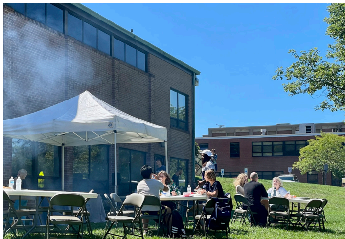
Faculty enjoying the free food provided by the First Free church.