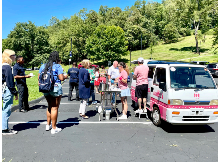
Students and faculty line up for Millie's Ice Cream Truck, provided by the First Evangelical Free Church.

The church has done other different things for students like "de-stressifying" by bringing snacks during finals or collecting food for the food pantry. The church has also always offered a "college and young-adult gathering" every