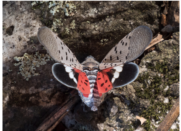
Adult Spotted Lanternfly ( Lycorma delicatula )

"I haven't heard that they go after plants that pollinate...it seems to be