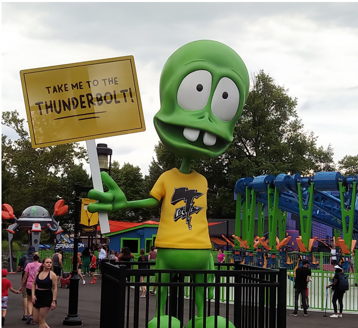
Kennywood park still open for fun.