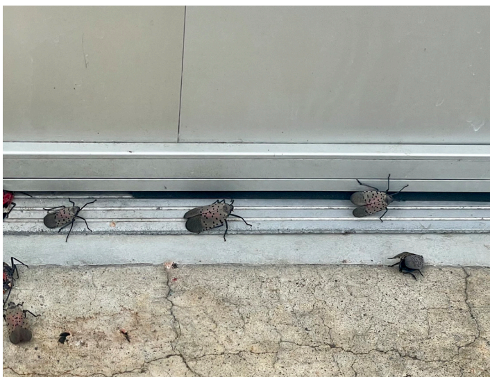
Lanternflies swarm around the SCC entrance.

To learn more about SLF, visit https://www.aphis.usda.gov/aphis/resources/pests-diseases/hungry-pests/the-threat/spotted-lanternfly/spot- ted-lanternfly .