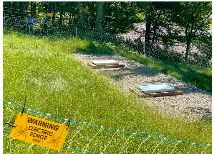
Apiary for Grimes’ two hives, set up by facility members.

up there, then the facility folks created a gravel area up there and made these cement pavers to set the hives on,” Cella added.