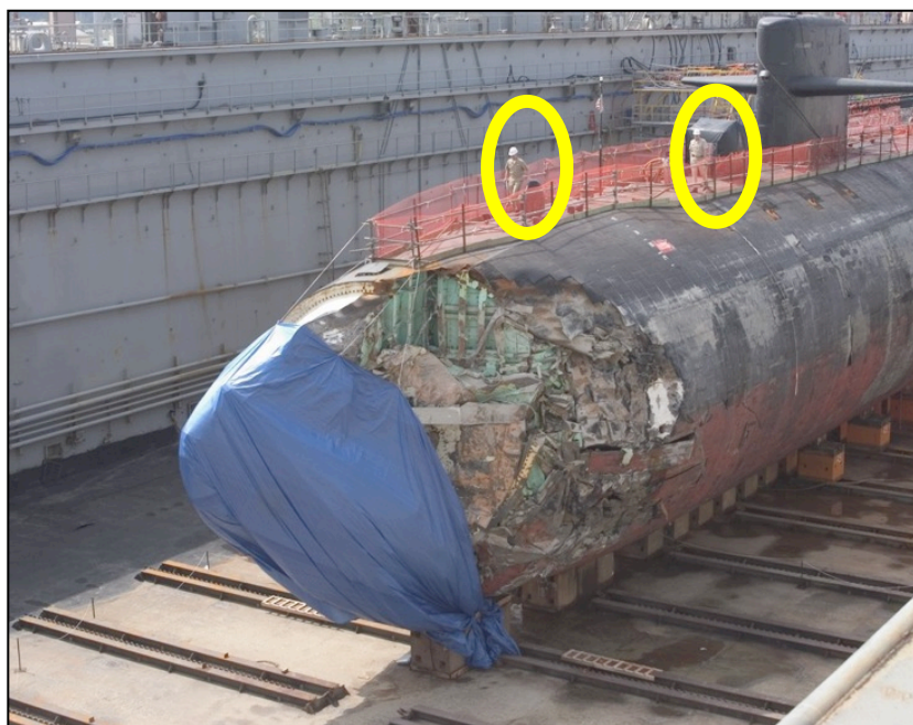
Fig. 1. Photograph of the USS San Francisco in dry dock after the accident. Note the men walking within the orange, gated area on top of the submarine for scale.

On January 8, 2005, the nuclear submarine USS San Francisco ran aground enroute from Guam to Brisbane, Australia. In one of the worst submarine accidents in U.S. naval history, the sub crashed into a large seamount (an underwater volcano) that rose 2000 m from the surrounding ocean floor. The seamount could have been avoided if it had appeared on the navigational charts used by the sub. Four minutes before the crash the submarine's sonar measured a false depth of 2000 m. The crash actually occurred at a depth of ~160 m, while traveling at a speed of 33 knots or ~38 mph (by comparison the average cruising speed of most oceanographic research vessels is 10-12 knots). The impact of the collision punched huge holes in the forward ballast tanks of the sub ( Figure 1 ), which in turn shut down the throttles, and caused the sub to drift listlessly, its bow pointing down. Luckily, the sub's nuclear reactor and the crew's quarters were not compromised. However, one crewman was killed in the accident and 115 were injured. The rest of the crew managed to keep the sub from sinking during a harrowing 30-hour, 360-mile transit back to Guam.