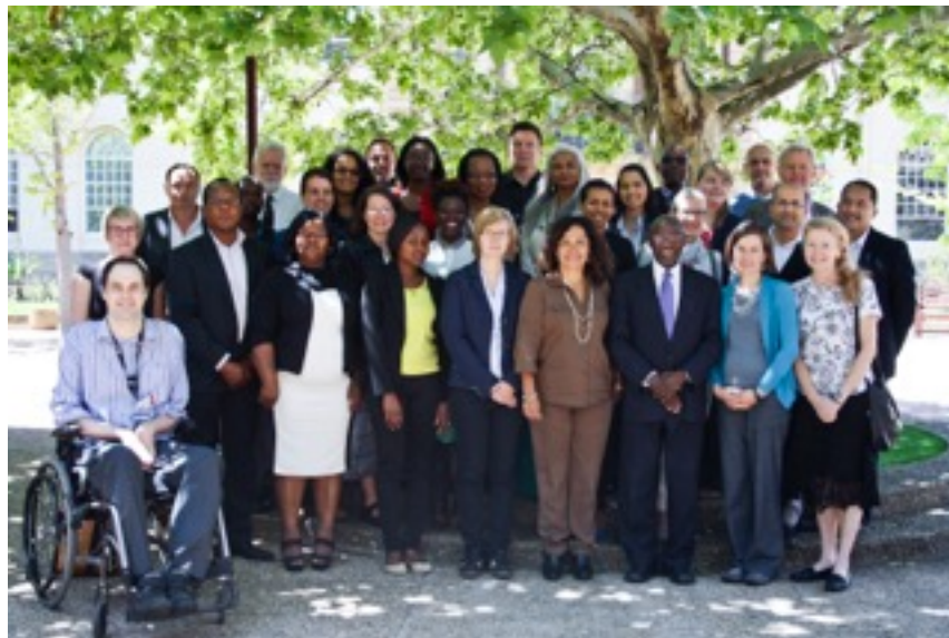
Delegates from five universities and government representatives at the 3 rd meeting of the Pan University Network for Global Health

THIRD MEETING REPORT UNIVERSITY OF CAPE TOWN CAPE TOWN, SOUTH AFRICA 12-13 OCTOBER 2015