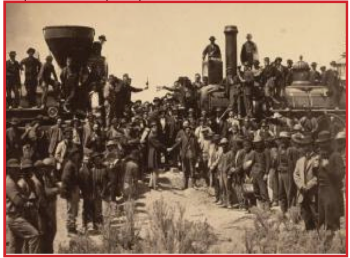
"Golden Spike" Ceremony Promontory Summit, Utah in May of 1869. Uniting of the tracks between the Union Pacific and Central Pacific Railroad companies. Chinese immigrants were excluded from the photograph.

It was clearly identifiable who was in charge because the individuals were positioned around the only person sitting, or privileged enough to sit, the medical practitioner. The immigrants of the picture faced the center of the room where at a table one Caucasian man sat, fitted in a white coat, presumably a doctor or medical practitioner, while another in military-like uniform prodded the face of one immigrant. It appeared as if the center of the room signified the highest level of power, white and male, and the more distant people were from this nucleus, the farther they symbolically were from attaining that privilege. The frame's inclusion of the entire room and centering of the practitioner placed the "patients" symbolically on the edges of power. The picture reflected a sense of obedience or compliance to those of authority that was associated with Asian culture. According to Cheung, this respect was construed as "submissive and passive in the eyes of non-Asians" (175). Masculinity connotes a sense of power, particularly within a patriarchal society like the United States. Chinese male immigrants, however, were refused this privilege and thus held at a status more equivalent to the position of women, though its important to acknowledge that the level of privilege within gender varied in their own right. Even though Chinese males identified with the gender of power, they were racially disqualified (175).