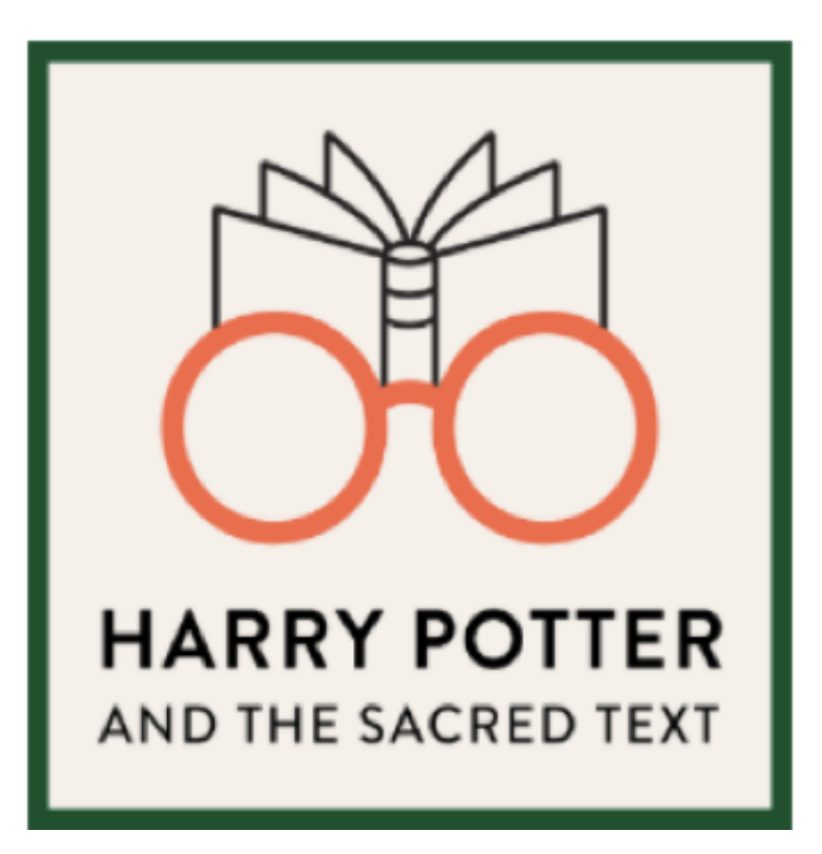
Figure 1 Harry Potter and the Sacred Text logo.