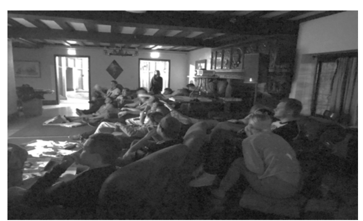
Figure 1: This is the screening room in our fraternity's club room.