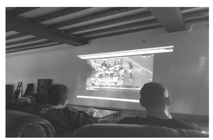
Figure 2: The size of the projector is 100 inches.