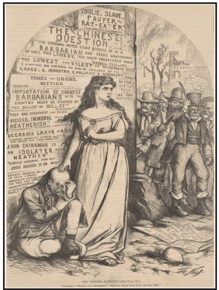
Political Cartoon of Chinese immigrant protected from nativist labor backlash by Miss Columbia. Artist, Thomas Nast, 1871.

to labor despite a worker's race, and yet the image itself suggested a racial delineation along the lines of masculinity.