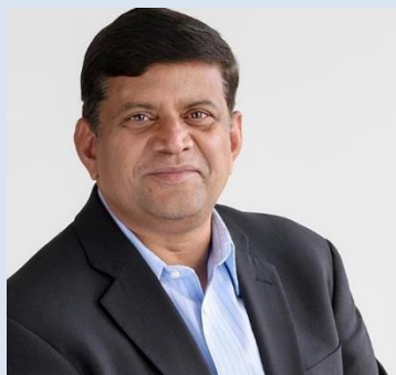
President & CEO at Immunome

Board Member at Immunome, Vaxess Technologies, Ohm Oncology