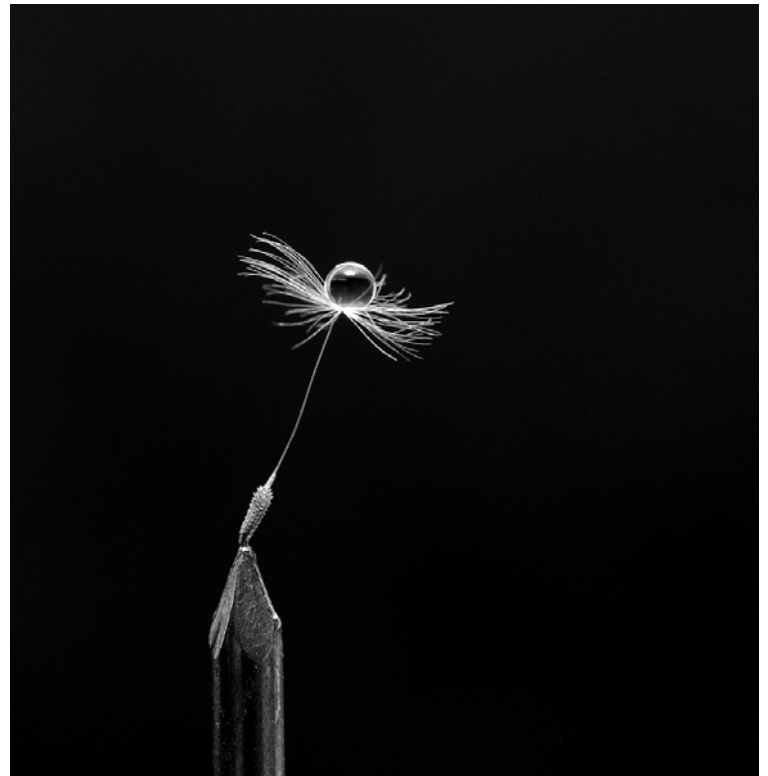
Balancing Act