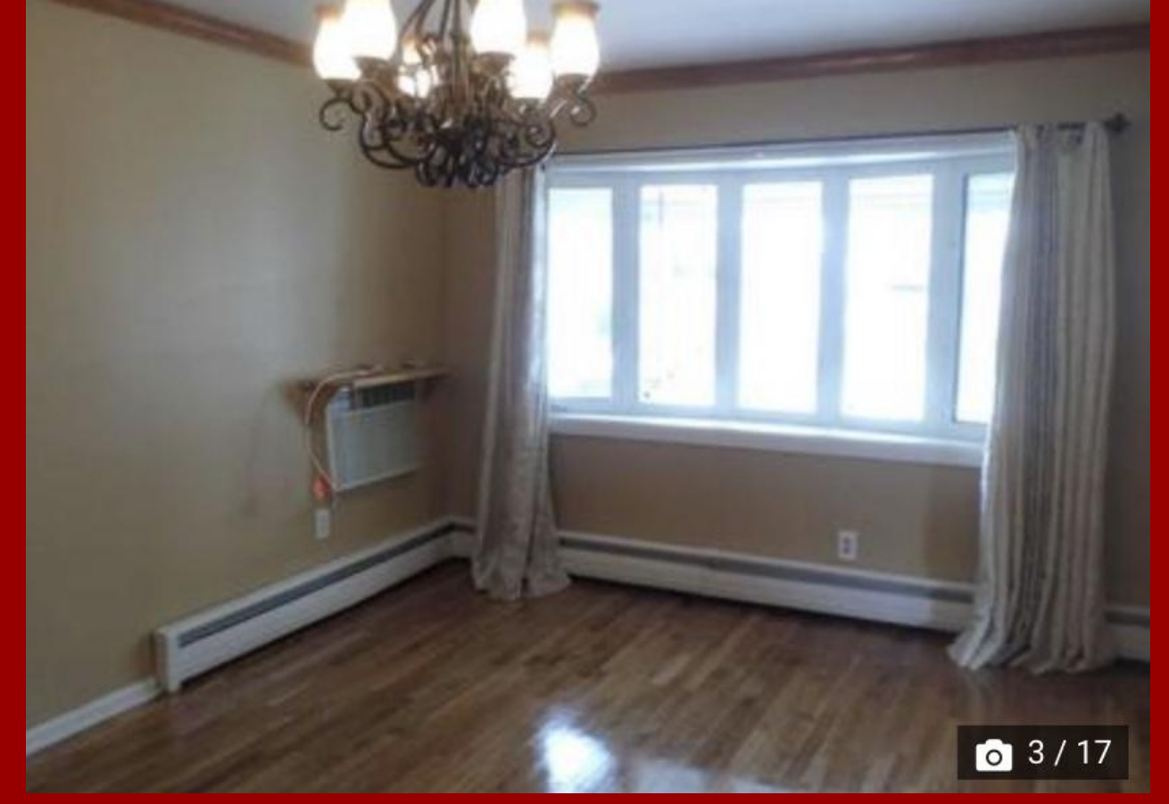
Window-I think for this window I want to make it just one big window instead of the five.