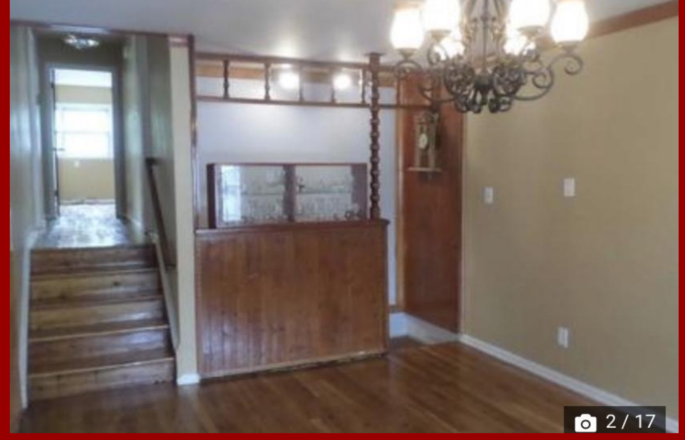
Floor- I imagined them to have very simple hardwood floor similar to this, maybe a darker wood but I think this is perfect.