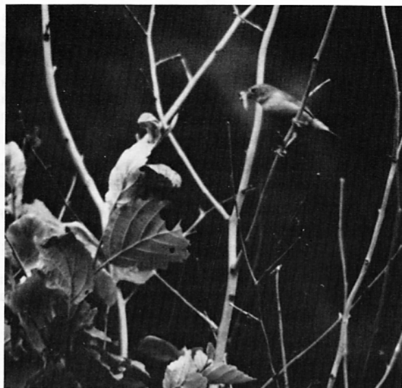
Figure 5. An immature yellowthroat feeding on the ROW. This was the most common species on the ROW.

cover on the ROW and singing on the edge; an ovenbird was observed foraging on the ROW. Red-eyed vireo were also foraging on the ROW and singing on the edge. Scarlet tanager were observed singing on the ROW-forest edge. White-breasted nuthatch were climbing and calling on the ROW. Downy woodpecker were calling and foraging on the ROW and climbing and foraging on the edge. Great crested flycatcher were observed calling and singing on the edge. The net effect of the ROW appeared to be an increase in the diversity of habitat in the forested area through which it passed by acting in effect as a shrub-herbaceous opening in the forest that was used by both shrubland and forest bird species.