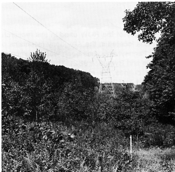
Figure 1. A ROW sample unit, maintained with herbicides, with a high population of 11.2 birds per hectare counted per census day. A shrub-herb-fern-grass plant cover along with resurgent trees was present.

The adjoining oak-hickory forest was a 2- to 3-layered community which consisted of various combinations of a tree layer, 12 to 18 M tall, several shrub layers, and an herb layer (Figure 2). Many openings had been created through dying of trees; mostly as a result of insect attacks. Dense tree reproduction was present in both shrub and herb layers. Typical shrubs in the forest were witch-hazel, blueberry, and teaberry with sparse bear oak and sweetfern in the larger openings. Very little fruiting of shrubs occurred in the forest in marked contrast to abundant fruiting on the ROW.