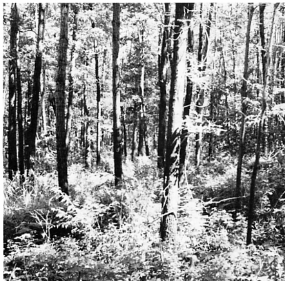
Figure 2. Typical oak-hickory forest adjacent to the ROW. The forest was two-layered with a 1 M-tall herb layer and a 12 to 18 M tree layer.