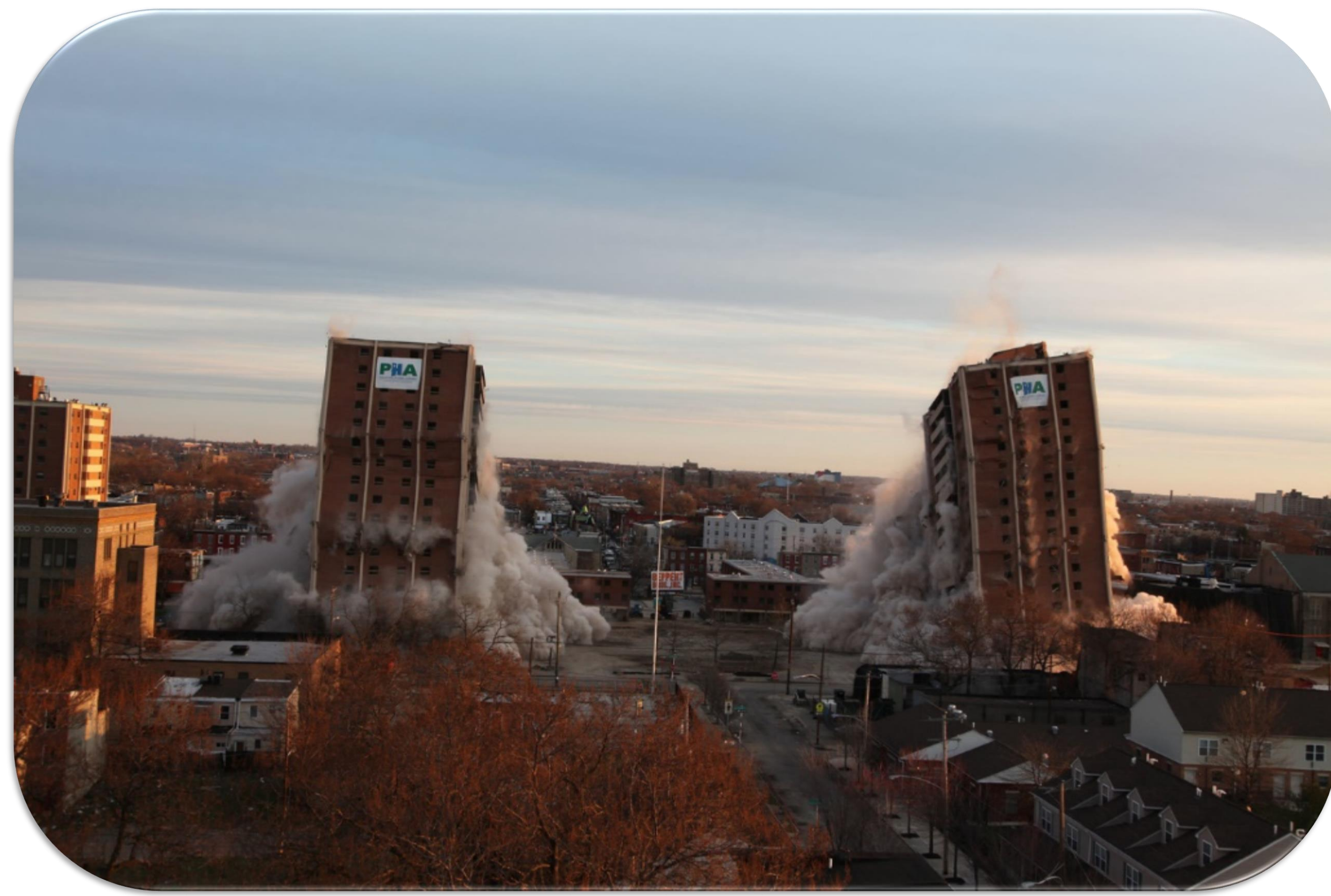
Norman Blumberg Apartments being imploded on March 19 th , 2016