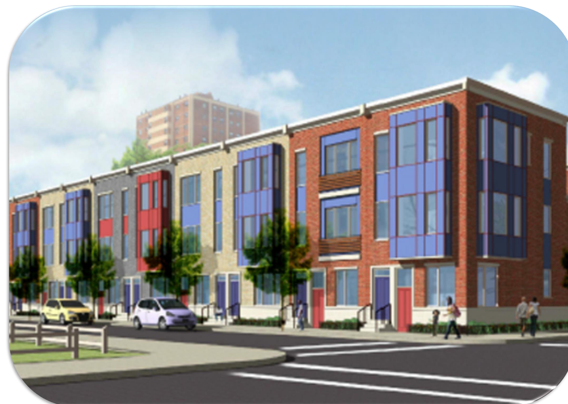
The pictures on the left and right are current conditions. The one in the middle shows a possible plan for these areas.